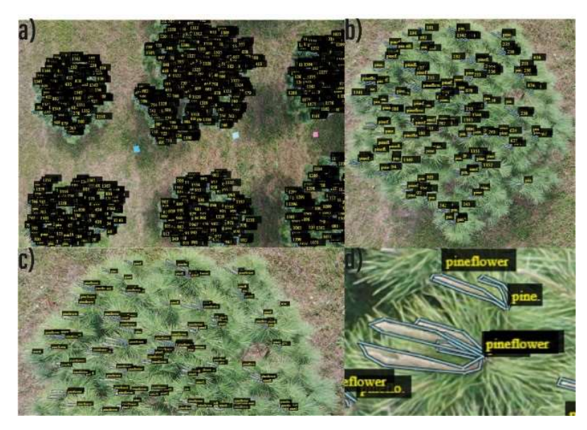
Figure 4. Image with the labels indicating pinecones of 1 year (flowers). a) Full image with labels, b) Zoom of 2.5x, c) Zoom of 5x, d) Zoom cropping of 5x.