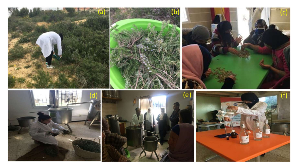
Figure 6. Steps of collection and transformation of rosemary into essential oils.

The first thing to do is to prepare the plant material for distillation by removing the excessively woody parts. At this position, we can reduce the size of the branches if too long, also to facilitate loading into the boiler (Figure 6a).