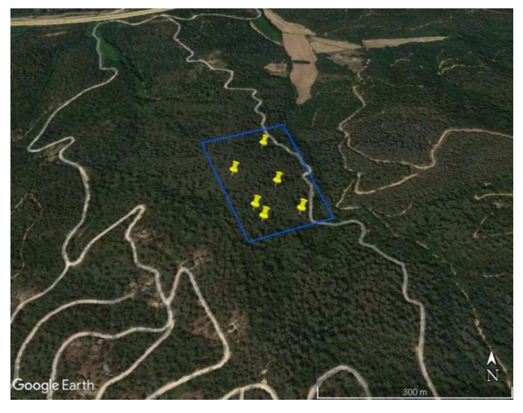
Figure 3. Drone flight planning in Pinus pinea natural forests.