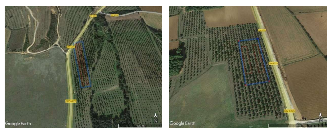
Figure 2. Drone flight planning in Pinus pinea plantations.